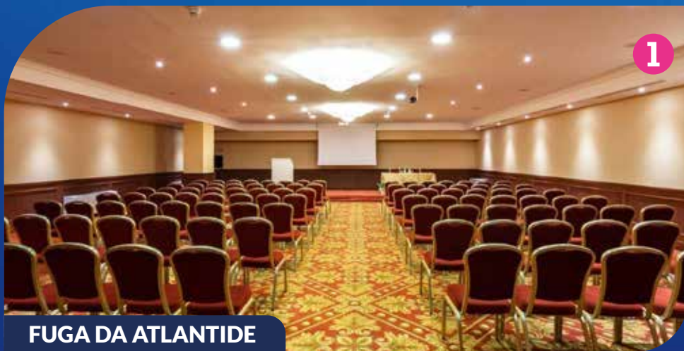
FUGA DA ATLANTIDE

The “ Fuga da Atlantide ” and “ Jungle Rapids ” rooms are located in a sublevel of the Gardaland Hotel. They can be used either individually or as one large room.