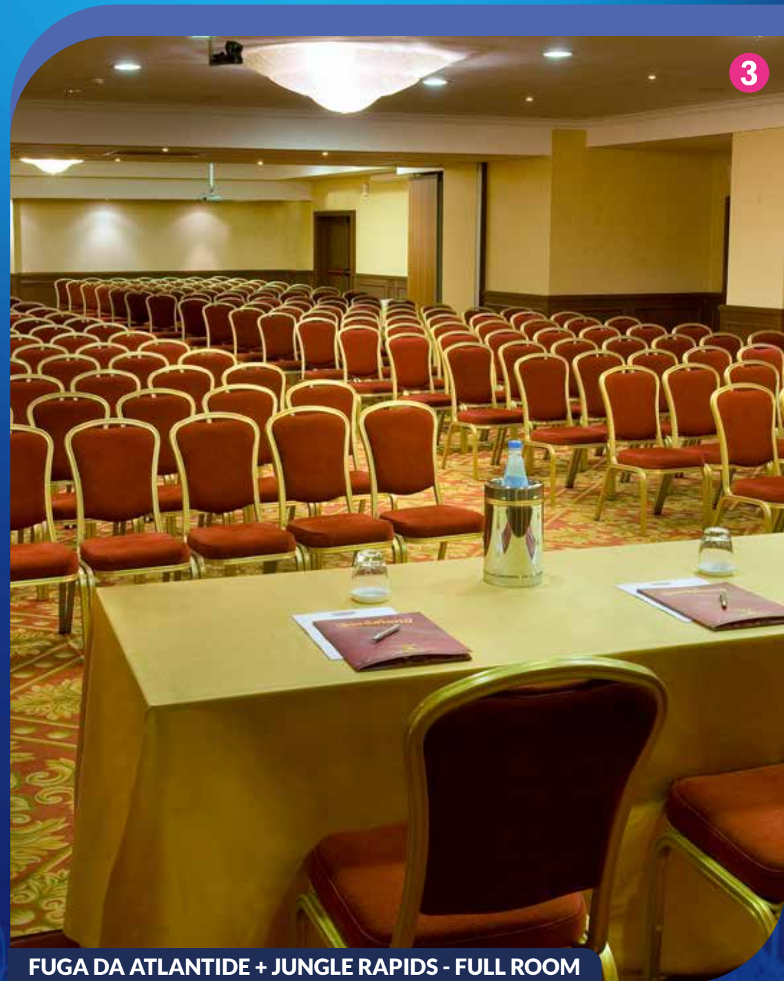
FUGA DA ATLANTIDE + JUNGLE RAPIDS - FULL ROOM